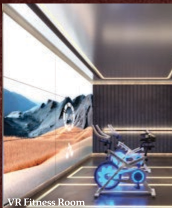
VR Fitness Room