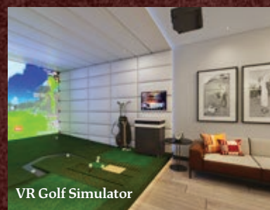
VR Golf Simulator