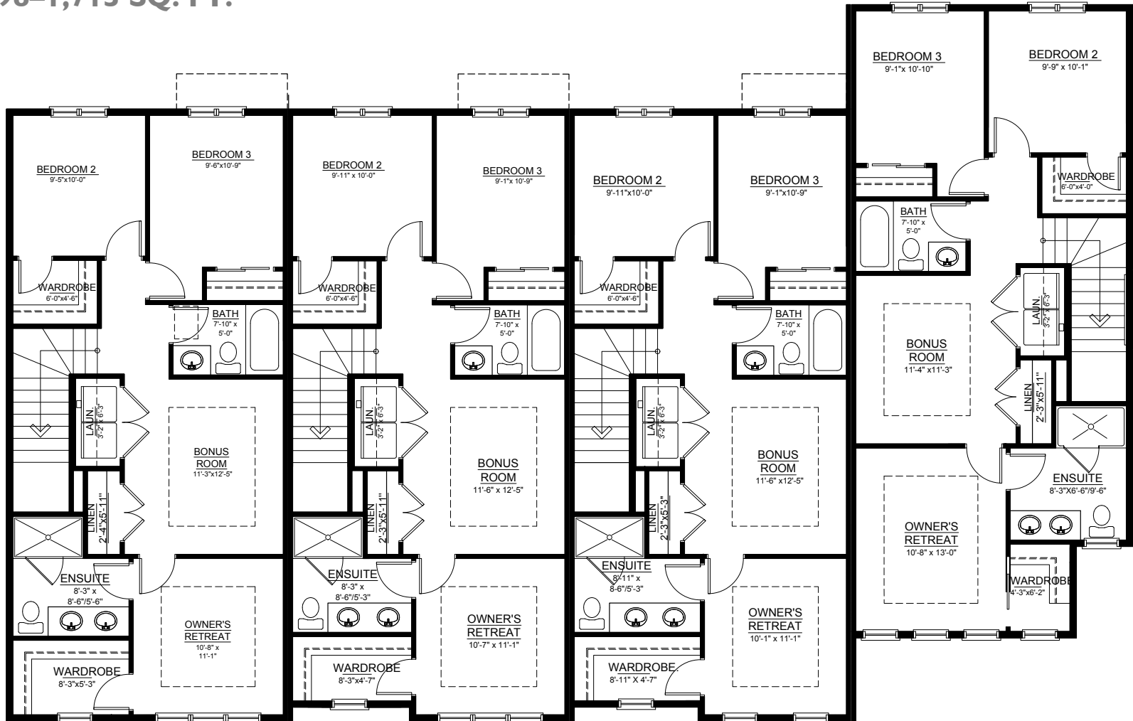
#537 UPPER FLOOR ±870 SQ.FT.