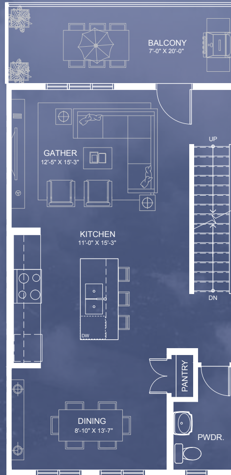
MAIN LEVEL ±689 SQ. FT.