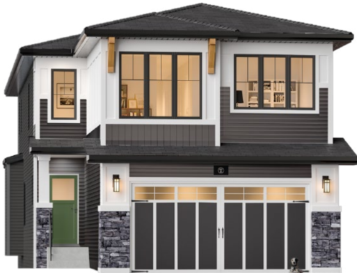
WEST COAST MODERN