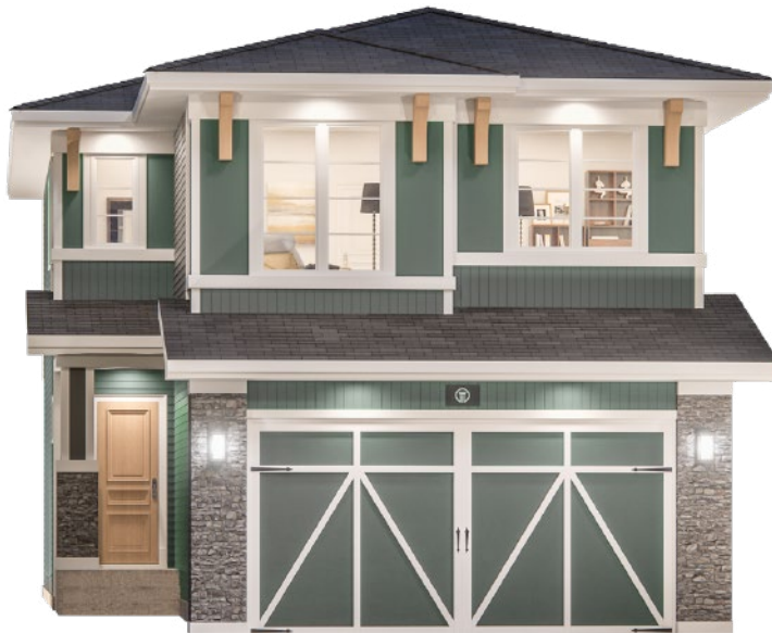
WEST COAST MODERN