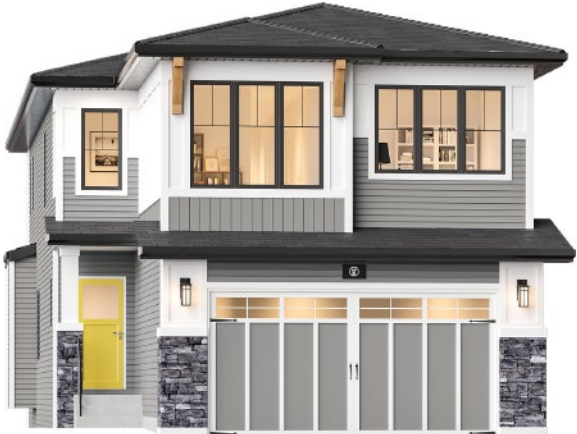
WEST COAST MODERN