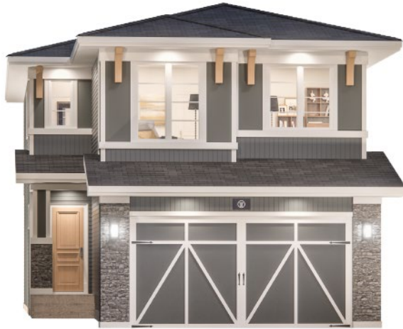
WEST COAST MODERN