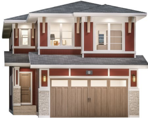
WEST COAST MODERN