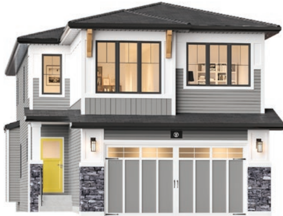
WEST COAST MODERN